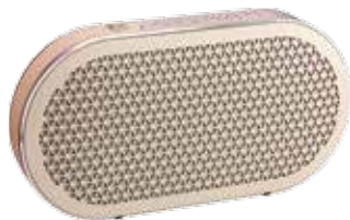
DALI speaker, $699, dali.com.au