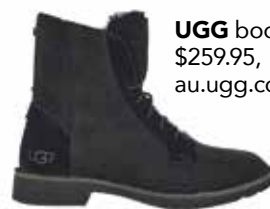
UGG boots, $259.95, au.ugg.com