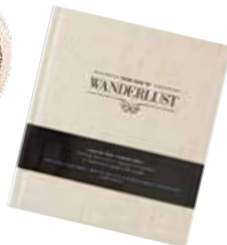
AXEL & ASH journal, $39.99, axelandash.com