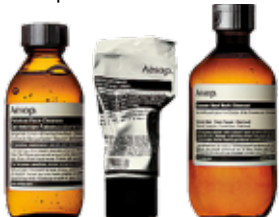
AESOP kit, $95, aesop.com/au