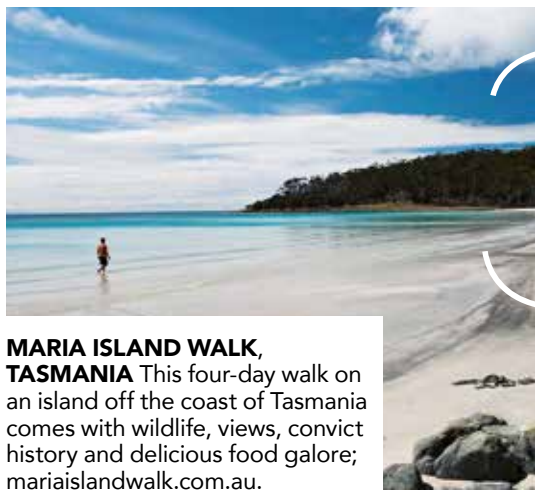
MARIA ISLAND WALK, TASMANIA This four-day walk on an island off the coast of Tasmania comes with wildlife, views, convict history and delicious food galore; mariaislandwalk.com.au.