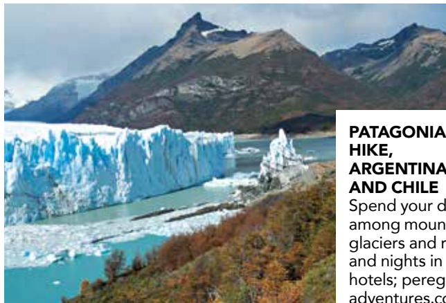
PATAGONIA HIKE, ARGENTINA AND CHILE Spend your days among mountains, glaciers and rivers, and nights in chic hotels; peregrine adventures.com.

There's no better way to appreciate spectacular scenery than on foot. But if it's been a while since you laced up your hiking boots - and you're one of those travellers who appreciates their creature comforts, too - never fear: luxury hiking is the perfect solution. Stride out into nature's wonders - and then relax with a glass of red and a gourmet dinner. It's the best of both worlds. ★